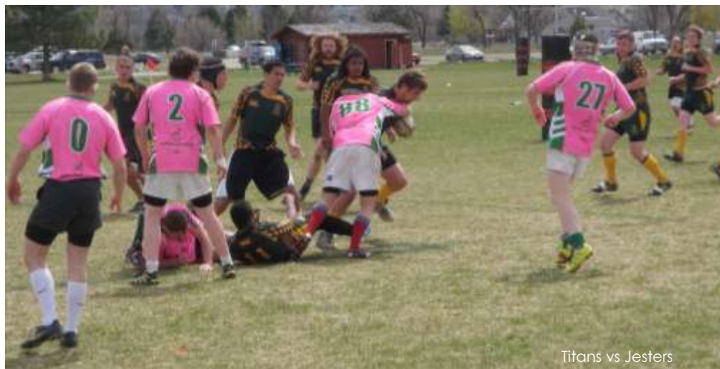
Titans vs Jesters

It's been a long time between drinks but the Mighty Titans finally made it back down to the Maggotfest of 2011. Thirty young hardy men and two really old men made the treacherous 14 hour trek all the way down to Canada's big brother, America. Other than some projectile vomits and a bit of public nudity by the 20 rookies, I am pleased to say that the trip to Missoula, Montana went very well. Arriving in Missoula on Friday at noon, was the perfect preparation for the tough partying, I mean, rugby ahead.