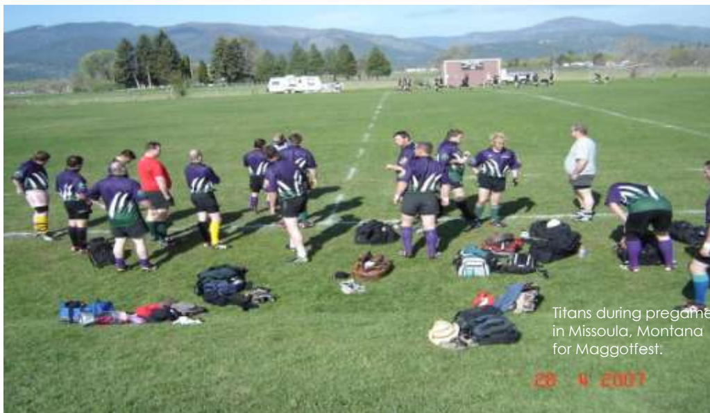
Titans during pregame in Missoula, Montana for Maggotfest.